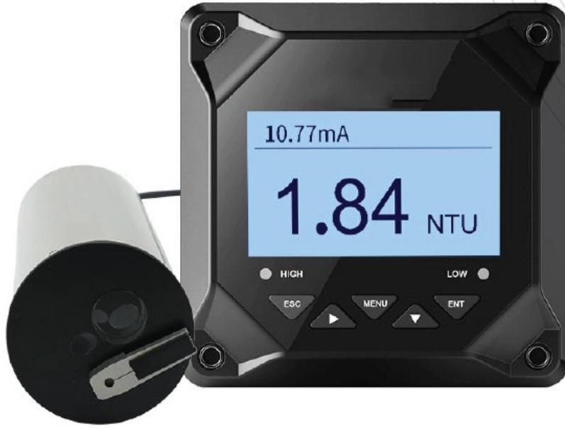
Turbidity meter PTU100